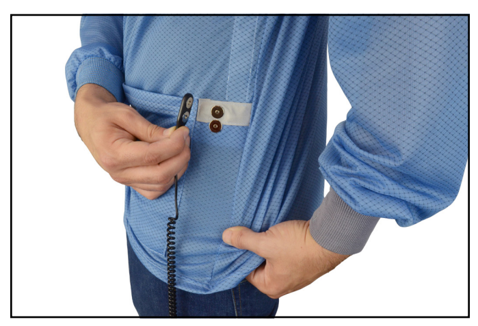
Figure 5. Connecting the SCS MagSnap® Dual-Wire Coil Cord to the Dual-Wire Static Control Smock

Connect the MagSnap® Dual-Wire Coil Cord to the two snap studs located nearby the left-hand hip pocket.