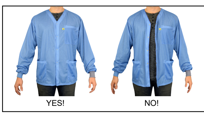
Figure 3. Proper wear of the Dual-Wire Static Control Smock

1. Put on the smock, and close the garment by fastening all of the snaps on the front. Verify that no clothing is exposed outside of the smock.