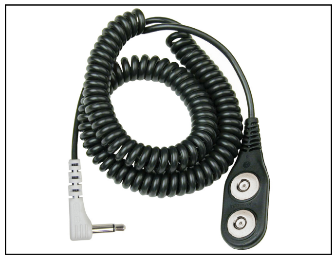
Figure 2. SCS 770110 MagSnap® Dual-Wire Coil Cord