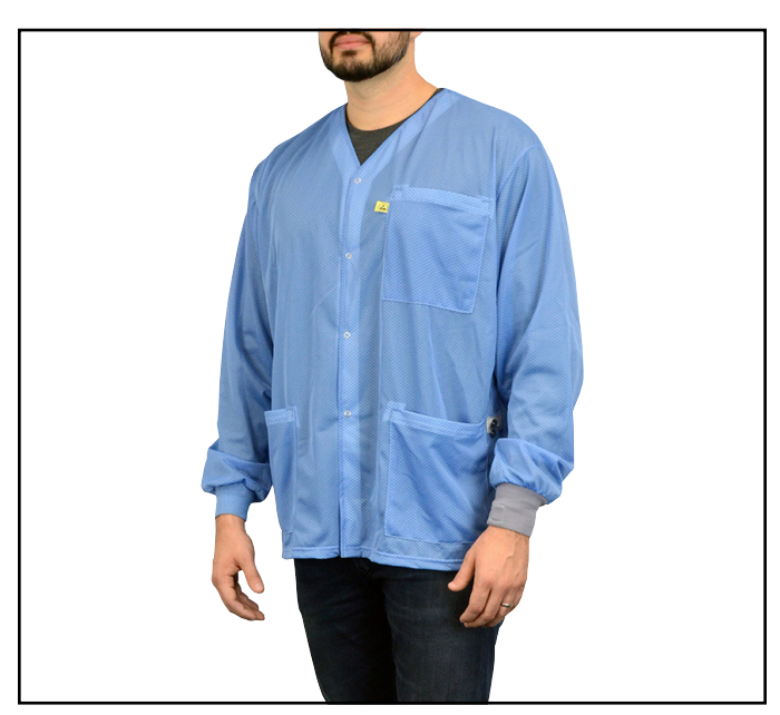
Figure 1. SCS Dual-Wire Static Control Smock