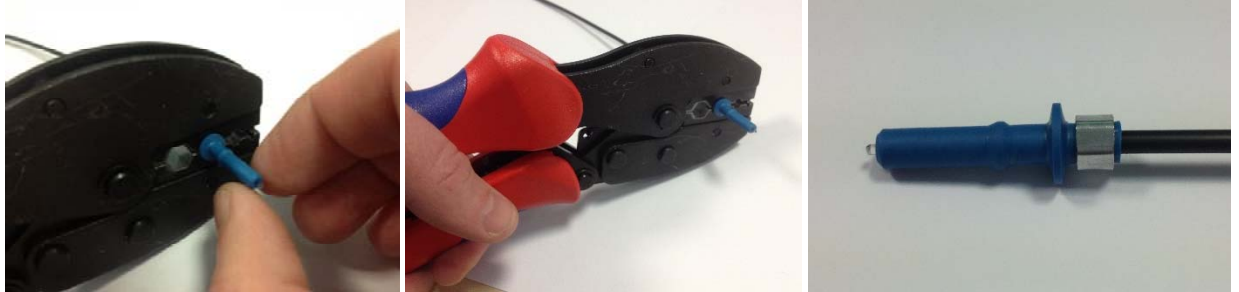
Figure 4. Secure Simplex Connector

Place the plug into a suitable crimp tool (e.g. FF-HTCRMP-1) with hexagonal crimp of 4.85 mm across flats. Use crimp tool to fasten the cable onto the plug. Ensure the crimp ring is tight and the simplex friction plug is undamaged after crimping.