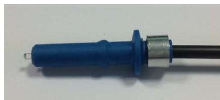
Figure 3. Cable and Connector Positioning

Insert the stripped POF cable into the backside of the connector until the mechanical stop is reached. Approximately 1.5 mm of the POF internal core should protrude from the top of the connector.