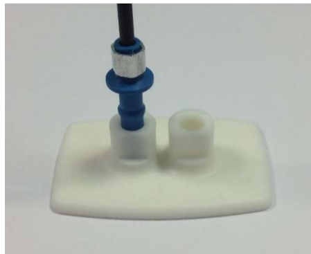
Figure 5. Polishing Disc

After polishing, wipe the connector with a clean tissue removing foreign particles. Using 3 \mu m grit, polish again for a smooth surface and wipe clean again. Best attenuation values are achieved applying wet polishing.