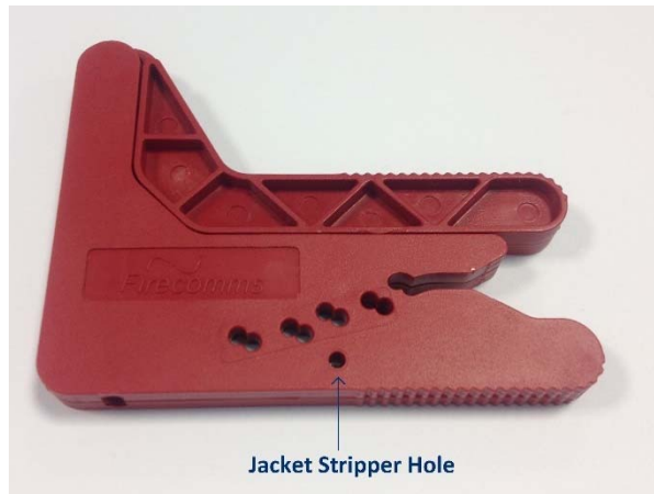
Figure 2. Jacket Stripper on POF cutter

In order to strip the jacket from the POF, insert the cable into the hole at the bottom of the Firecomms POF cutter (PC-220F-410). After insertion, twist the cutter 360 degrees to cut the jacket and pull out the cable to reveal the exposed POF core.